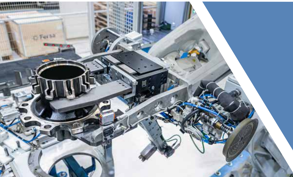
Assembly process robot.