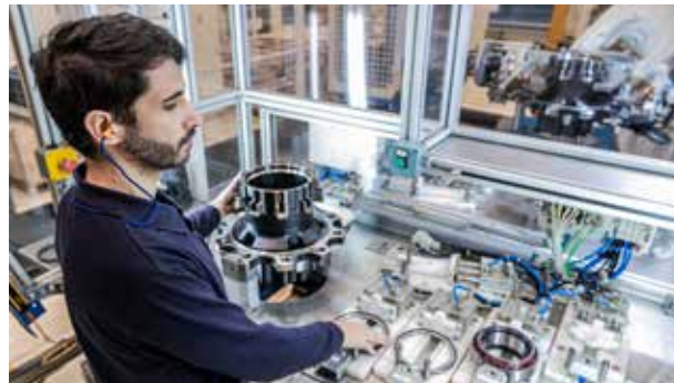
Preset hub assemblies control area.

We have a productive capacity of more than 60,000 preset hub assemblies per year.