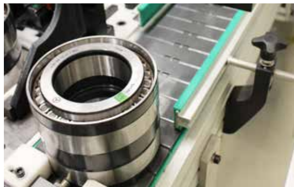
Reading and data collection through Datamatrix.