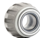
COMPACT WHEEL TRUCK F 300001