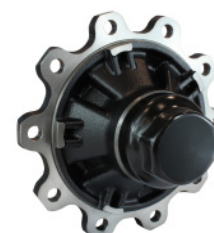
PRESET HUB F 400036