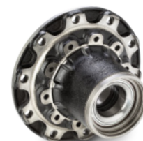
PRESET HUB F 400001